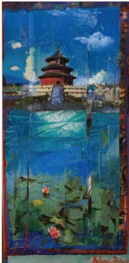
Arless Day, Clouds Over China , 2008, collage and gouache on board, 19" x 13" framed.

The exhibition is on view through July 30 th , 2010. ■